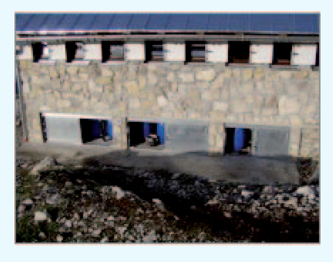
Figures 1 (top & bottom): Bettelwurfhütte in Tyrol, equipped with a urine diverting toilet system.