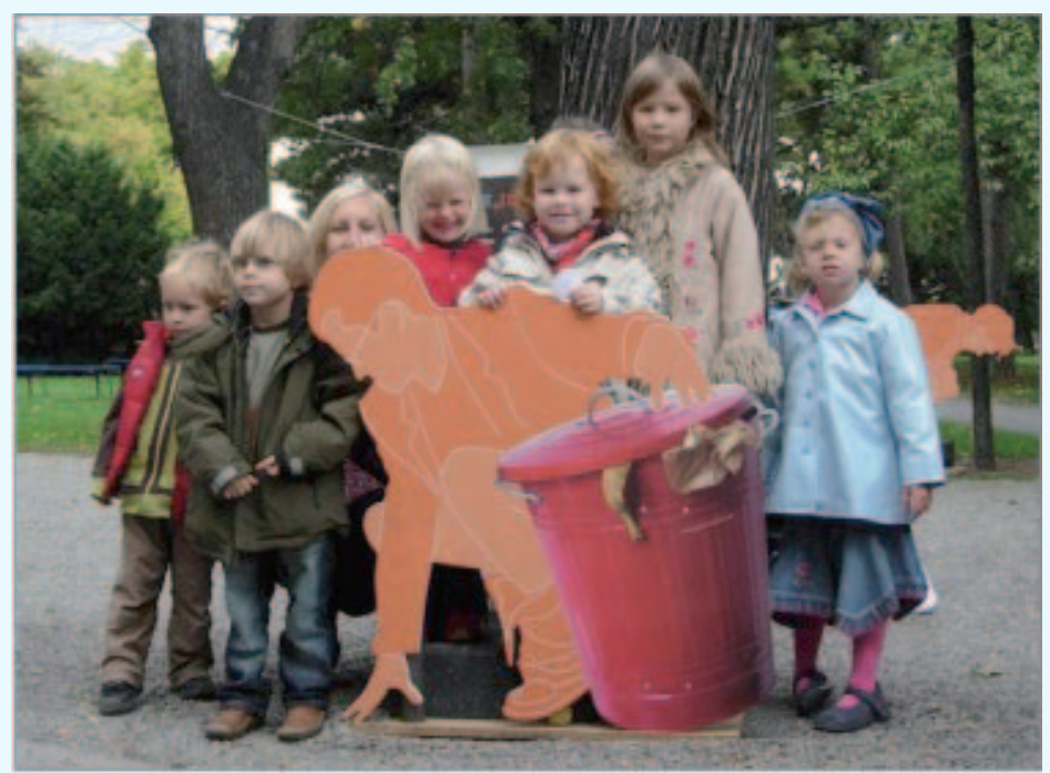
Figure 3: Children help to break the toilet taboo in Vienna.

More information on the "Sanitation is dignity" campaign is available at http://www.sanitation-is-dignity.org.