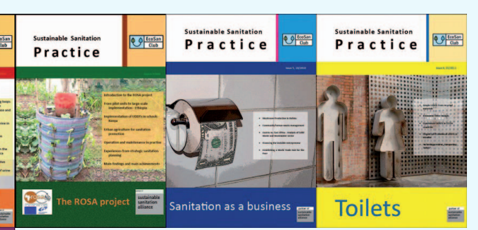
Figure 3: Title pages of the first 9 issues of the SSP journal

Name: Elke Müllegger Organisation: EcoSan Club