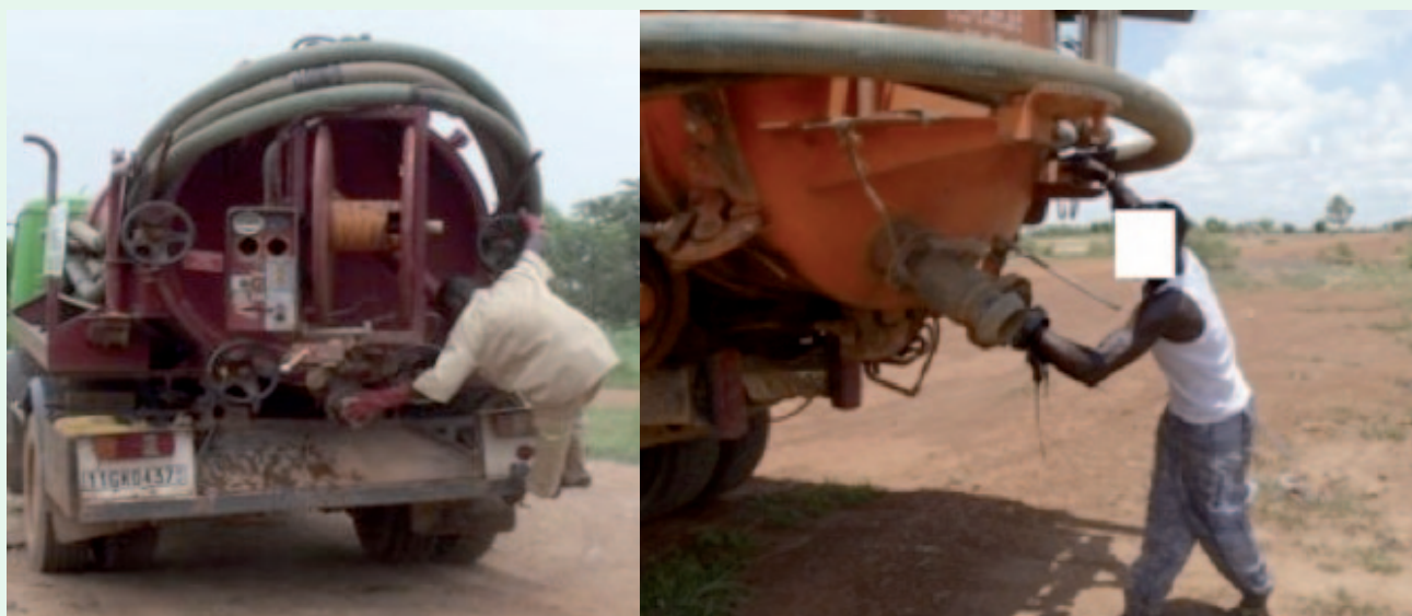
Figure 1: The collection and transport operators often lack of management skills, safety measures, and operate in poor hygiene conditions

The consultation activities of the collection and transport operators conducted from June 2010 to 2012 allowed to improve their recognition by the other stakeholders. Several information workshops were also held to discuss their difficulties and develop solutions. Their professional association was thus reorganized, and