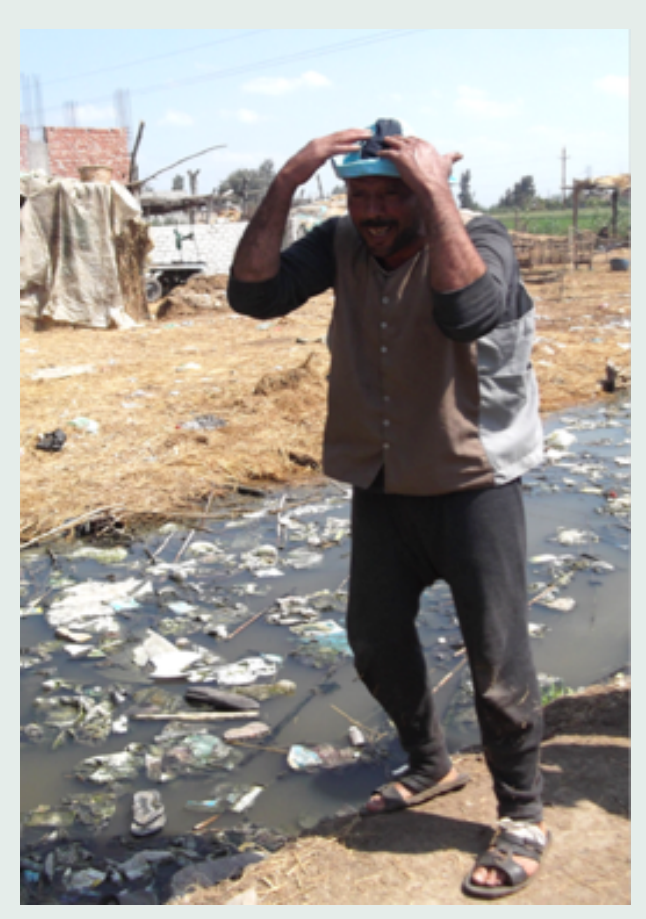
Figure 1. Nile Delta region is suffering the lack of proper sanitation facilities.

Our work aims at protecting and preserving regional water resources by creating integrated WASH solutions and building a youth-led enabling environment. The trained youth are developing BENAA's local and community-led solutions, which have significant impact and an increased possibility for successful scaling (BENAA, 2018). In addition, BENAA focusses on building up an enabling environment by: raising public awareness, facilitating institutional arrangements, fostering socio-cultural