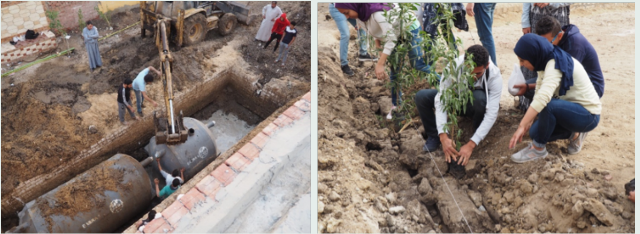
Figure 4. Implementing the EABRA system: Egyptian Anaerobic Baffled Reactor with Aquaponics/Hydroponics.