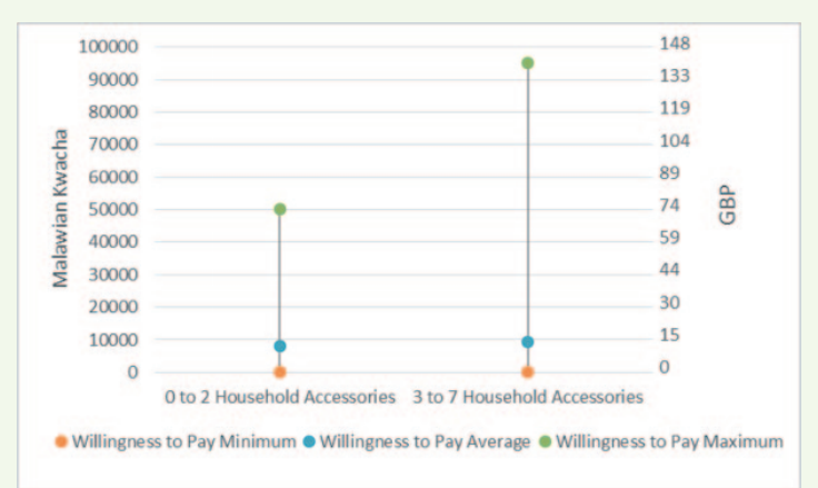
Figure 3. Number of respondents reporting ownership of any of seven household accessories (bike, cell phone, radio, television, cook stove, refrigerator and/or car) categorized by willingness to pay for an improved toilet. Respondents were grouped into two contingency categories (0-2 and 3-7 accessories) to represent lower and higher levels of household income, respectively. Respondent's minimum, average and maximum values in each category are presented.