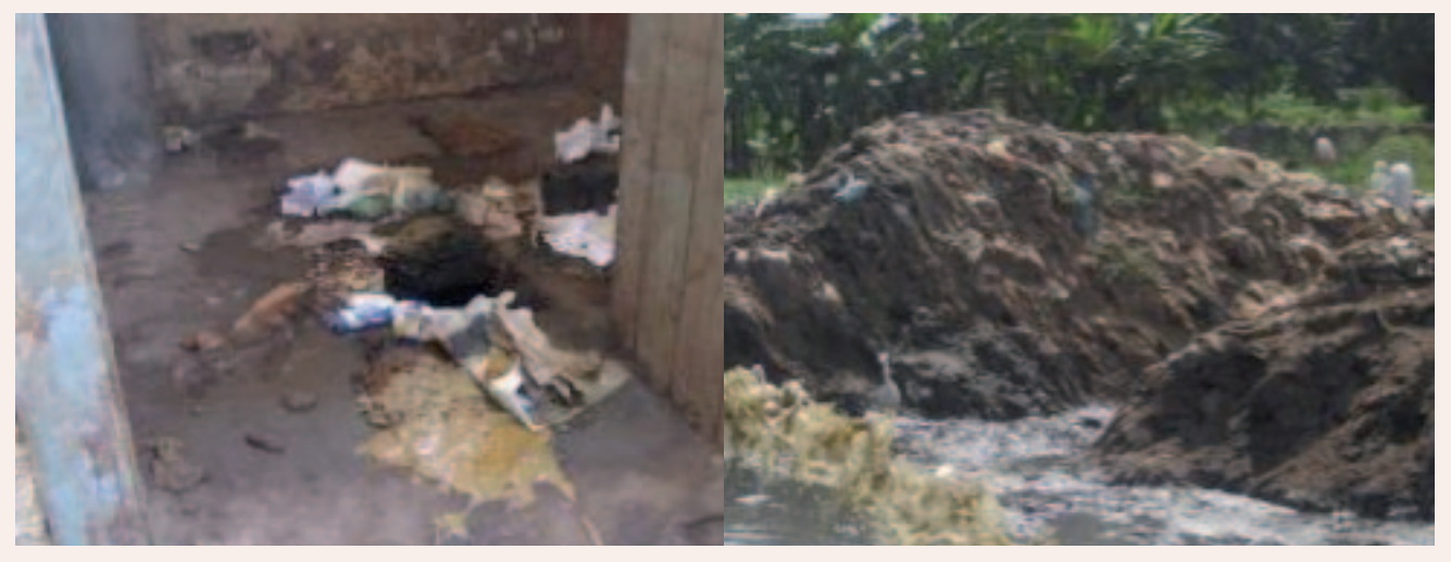
Figure 1: Abandoned toilet in an informal settlement in Kampala.

and households can afford mechanical collection and transport, there is often only insufficient treatment capacity available, Figure 2 hereby showing how faecal sludge is inappropriately dumped at the waste water treatment plant in Kampala. The lack of appropriate collection, transport and treatment is posing a serious threat to public and environmental health (Blackett et al., 2014).