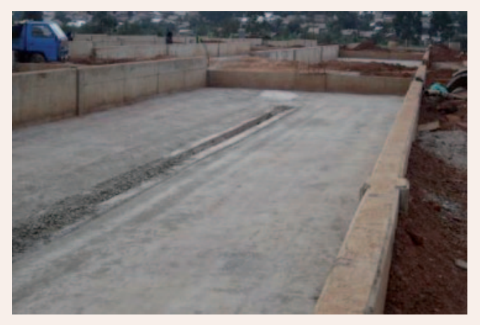
Figure 3: Drying beds in construction at the new faecal sludge treatment plant in Kampala.

The FaME market demand study showed that untapped markets exist for faecal sludge treatment products (Diener et al, 2014). Energy producing options showed the highest market potential. The FaME calorific value study indicated that dried faecal sludge has a calorific value competitive to other solid biomass fuels, which was demonstrated for two industrial applications (Murray Muspratt et al. 2014).