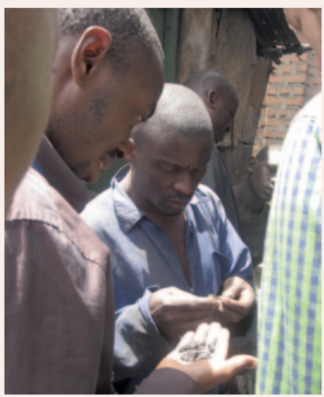
Figure 4: Raising interest of industrial users for alternative biomass fuels in Kampala.

The financial viability of faecal sludge products was analysed, based on a generic stepwise approach set out in Figure 5: