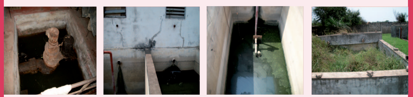
Figure 6. A WWTP in disrepair in Accra, Ghana. From left to right; pump, aerated reactors, settling tank, weedy drying bed.