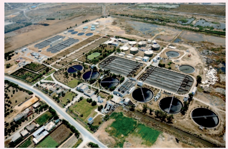
Figure 2. The Choutrana wastewater treatment complex (activated sludge + anaerobic digestion of excess sludge) in Tunisia. The 2 WWTPs, designed for a total of 1,300,000 population equivalent. Real flow rates: 3,250 m<sup>3</sup>/h for the oldest, 1,667 m<sup>3</sup>/h for the most recent (AI Ayni, 2012)

Figure 1. A WWTP (activated sludge) being operated in Accra, Ghana [From left to right; Stabilization tank, Aerated reactor, Settling tank and treated water tank, reused for lawns irrigation. Real flow rates: about 25 m<sup>3</sup>/h].