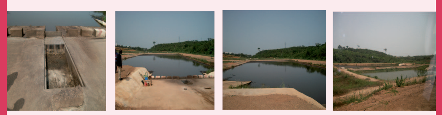
Figure 3. A faecal sludge treatment plant (pond system) in Sekondi-Takorady, Ghana. From left to right; Faecal sludge discharge area (from trucks); Series of ponds. Treats about 100 m<sup>3</sup>/d of faecal sludge.