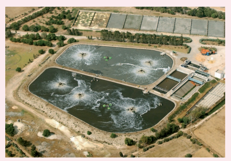
Figure 4. The Mahdia WWTP (aerated pond system), in Tunisia. It is designed for 150,000 population equivalent (Real flow rate: 426 m<sup>3</sup>/h). Treated water is UV-disinfected before discharge (Al Ayni, 2012).

Figure 3. A faecal sludge treatment plant (pond system) in Sekondi-Takorady, Ghana. From left to right; Faecal sludge discharge area (from trucks); Series of ponds. Treats about 100 m<sup>3</sup>/d of faecal sludge.