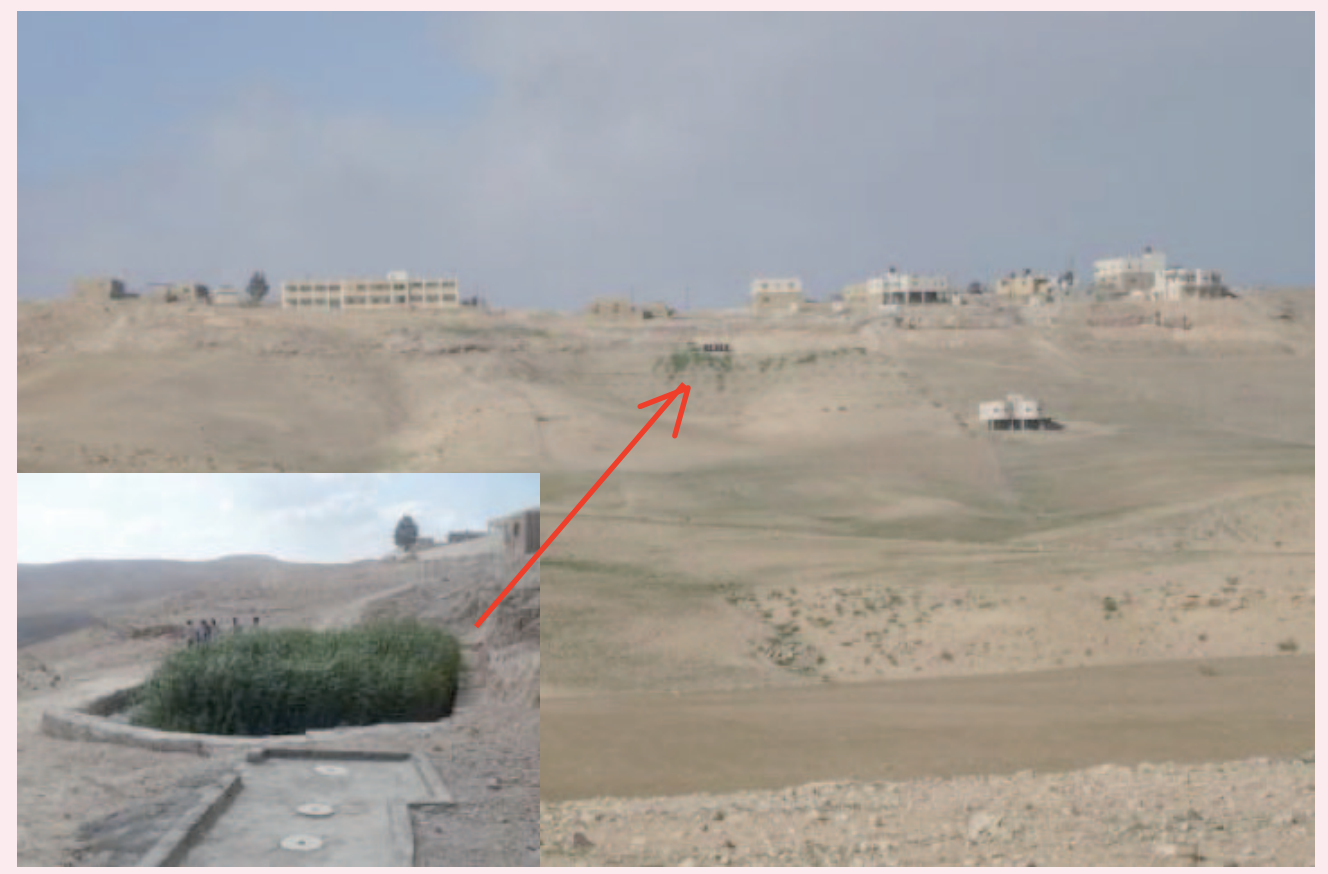
Figure 2: Greywater treatment CW in Al-najada, Hebron district, Palestine.